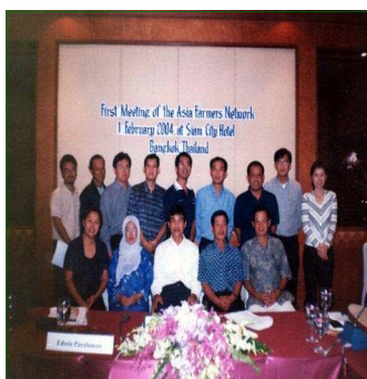
The ASFARNET held its first meeting in Bangkok, Thailand