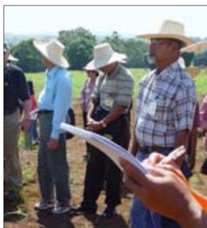
...learning new technologies through field visits and interaction with technology users and other stakeholders