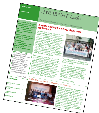
...keeping an open communication line among members...The ASFARNET newsletter provides updates on agri-developments. It is electronically available at www.searca.org/~bic