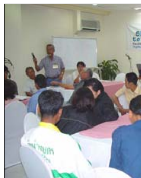
...letting farmers voices be heard and listened to